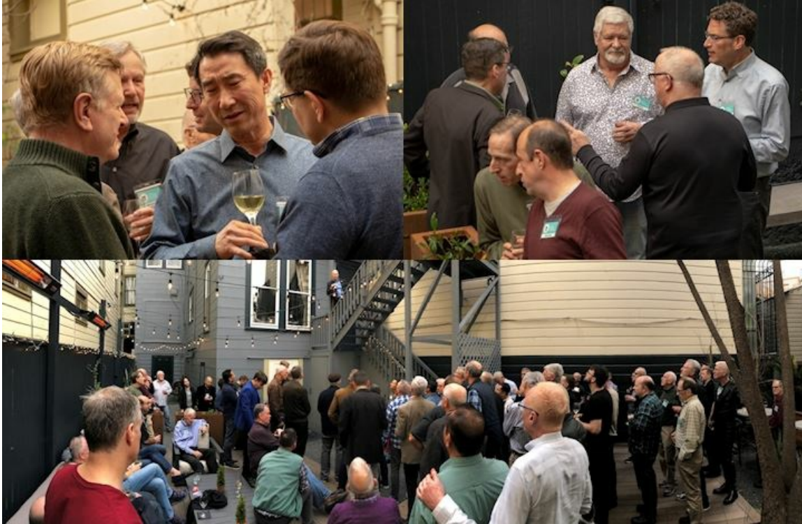
2020 Founders Day Celebration Party – Sunday March 15th at 2:00pm

This Event is Already 2/3 Full – Sign-Up TODAY!